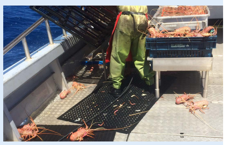
Above: This cakka box is too small! Consider upsizing your cakka box if lobsters are falling on the deck.

On the subject of cakka boxes, some fishermen falsely believe that a cakka box is big enough if it only gets overfull on 'big days', but these are precisely the days when the stakes are highest and quality is most likely to suffer. With the increase in catch rates under quota, all parts of your on board handling chain need to be reviewed to keep up. The picture below shows a cakka box that is way too small, causing lobsters to spill onto the deck and be exposed to extra handling, air exposure and hot dry winds. Check out the leg loss from the ones that have fallen on the deck! Many of these dropped lobsters will also have cracked shells, or internal damage and should be returned to the ocean.