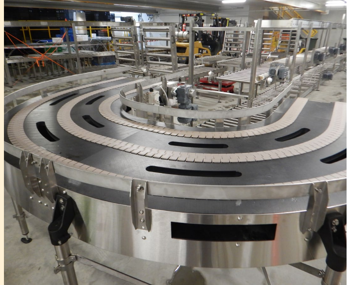
Above and below: The semi-mechanised packout system currently under construction at Welshpool.

Obviously we are disappointed to take this step, but looking on the bright side, this will allow the engineers full and unimpeded access to the facility so that they can finish off the third system, sort out the refrigeration gear, and complete a range of other smaller items on their list. These would have involved temporary shut-downs and work-arounds if we still held lobsters in the system, but that won't be an issue now. Once DRA have completed everything down to the final detail, and formally handed over control of the site to GFC, our own staff will be happy not to have to work around the construction team.