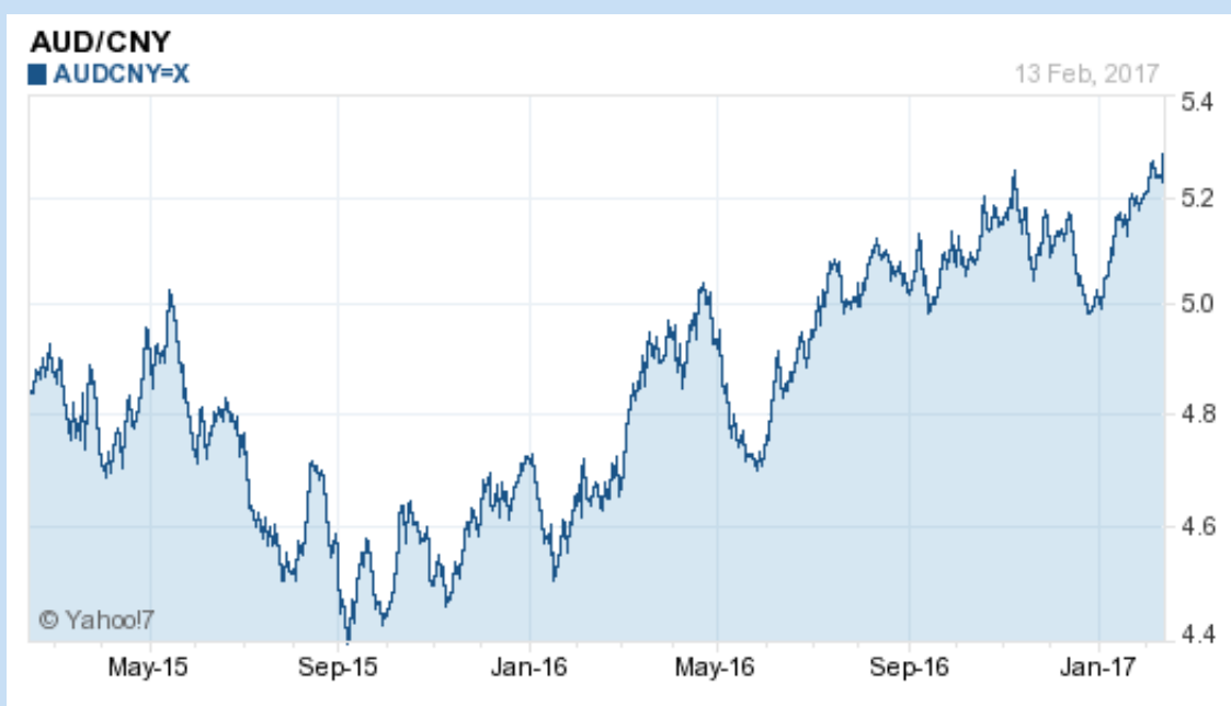
Fig 1: Australian Dollar v Chinese RMB over the past 2 years

Looking at Figure 1, you can see that this time last year, the Australian Dollar cost 4.6 Chinese RMB. By the first month of this season, the Australian Dollar had strengthened to the point where it is now worth over 5.2 RMB. That's a 13% strengthening of our currency, which directly removes more than $10/kg off the beach price, even though the selling price in Chinese dollars is the about the same. So, if we had exactly the same exchange rate as last January-February, the average beach price so far would be over $74/kg, before bonuses.